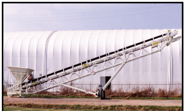
MARCO RADIAL STACKER