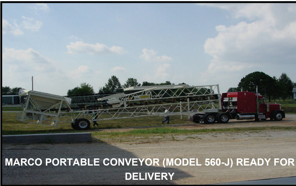
MARCO PORTABLE CONVEYOR (MODEL 560-J) READY FOR DELIVERY