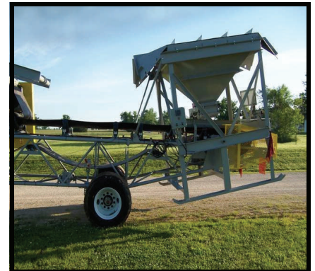
Hopper: Model 560