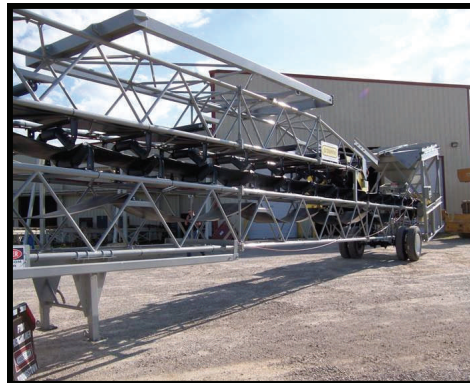
Model 560 Ready to Roll